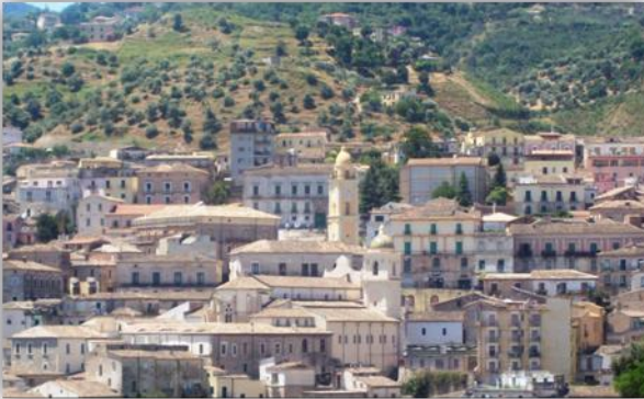
Rossano (Codex Purpureo e Patirio and Fabbricadell'Amarelli )