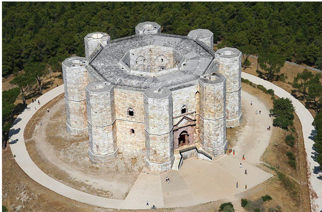
Castel del Monte