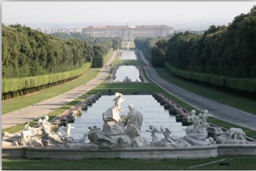
Reggia di Caserta