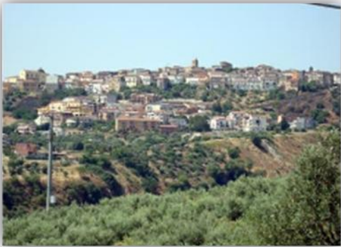
Terranova da Sibari