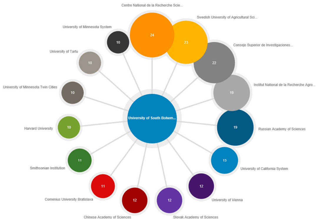
Numbers of USB publications in WoS for 2018 (as of 27 February 2019) that were created in cooperation with partner institutions abroad.