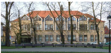
The building after renovation